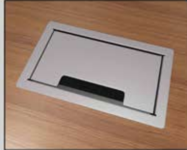
Silver Pearl Powder Coat