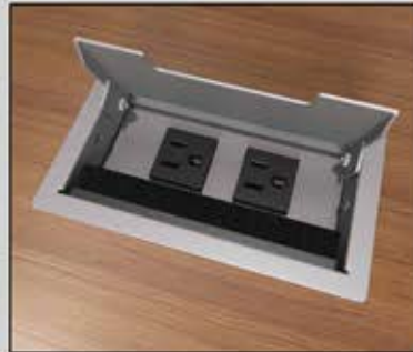
Silver Pearl Open