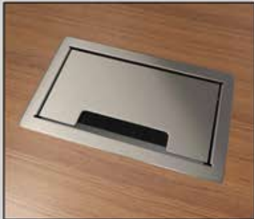
Brushed Stainless Steel